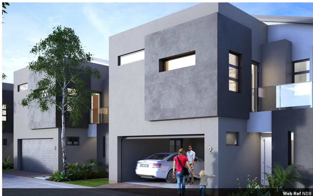
Web Ref ND8

354 Rivonia Boulevard Lillipark Office Park Suite 203, 2nd Floor Rivonia