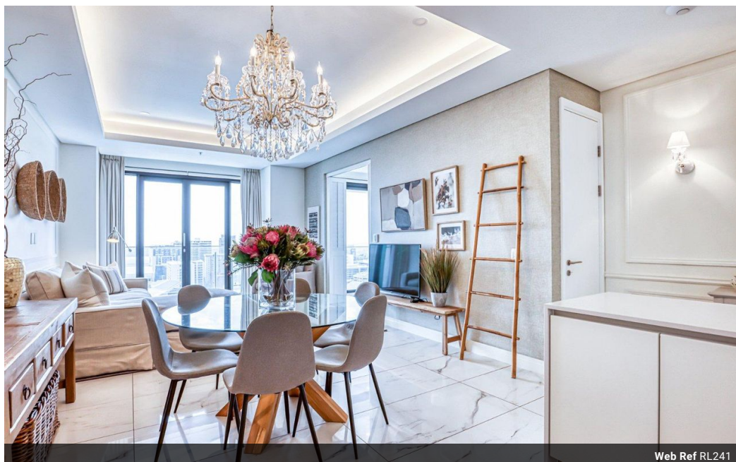
Web Ref RL241

354 Rivonia Boulevard Lillipark Office Park Suite 203, 2nd Floor Rivonia