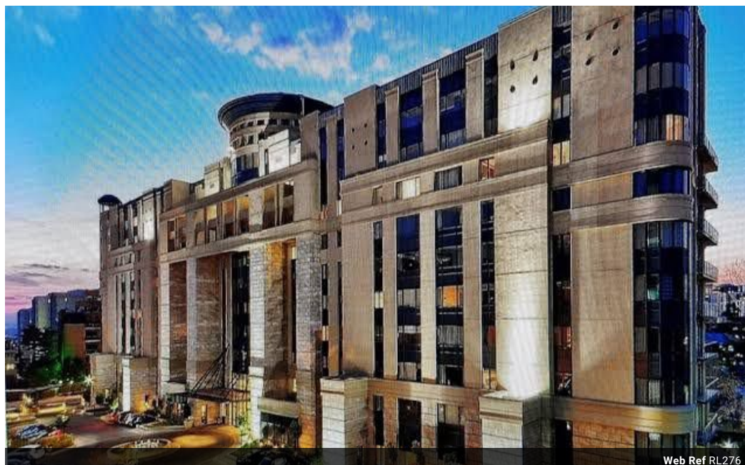
Web Ref RL276

354 Rivonia Boulevard Lillipark Office Park Suite 203, 2nd Floor Rivonia