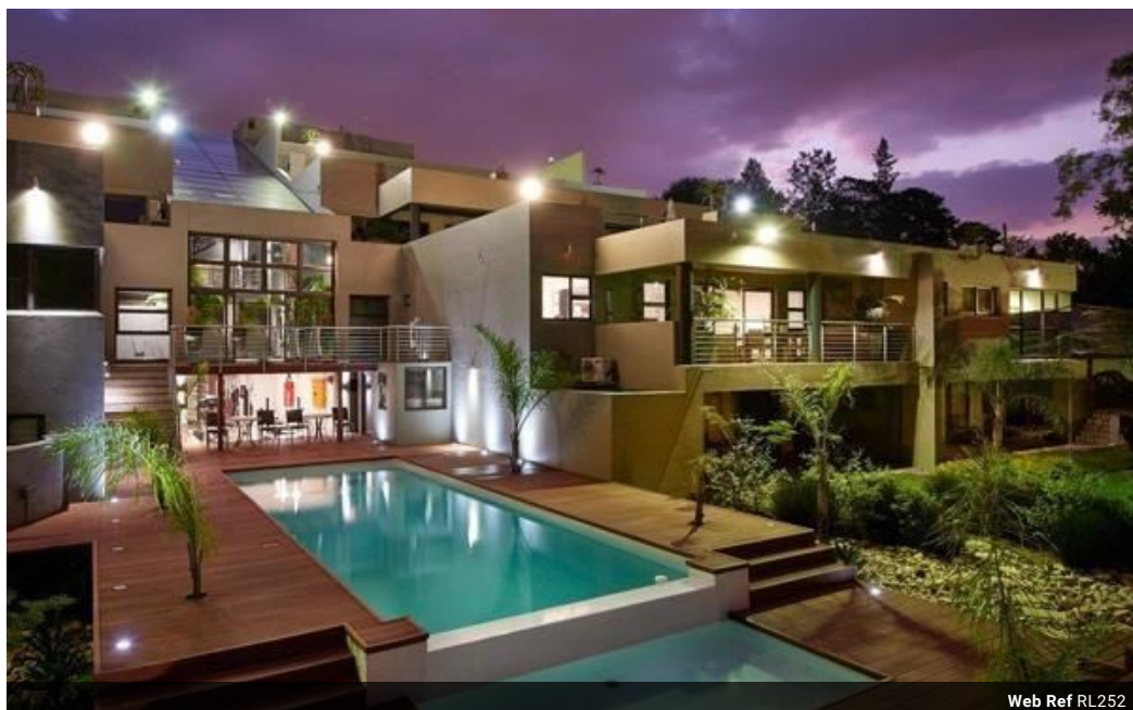
Web Ref RL252

354 Rivonia Boulevard Lillipark Office Park Suite 203, 2nd Floor Rivonia